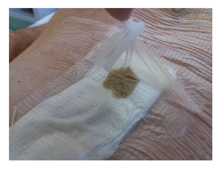
Figure 2. Two PVC film dressings adhered together over the orifice and around the drain to provide airtightness.