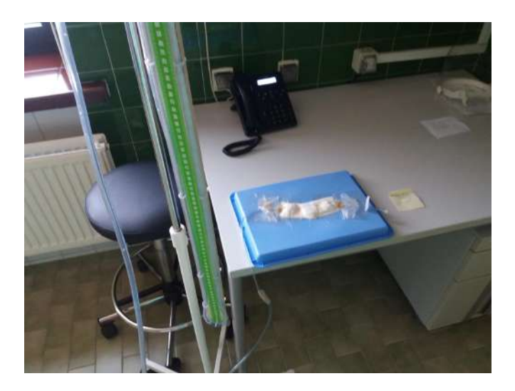
Figure 4. Dressing applied to the wound model with a liquid column to measure negative pressure.