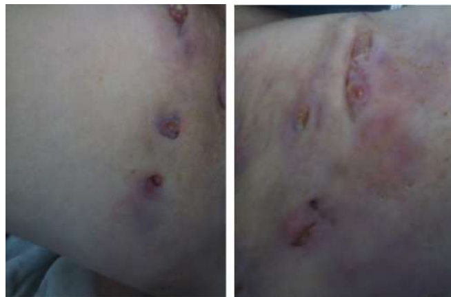
Figure 2. Photographs taken by the patient at home and sent by the iWound App 6 weeks after she was discharged from the hospital.