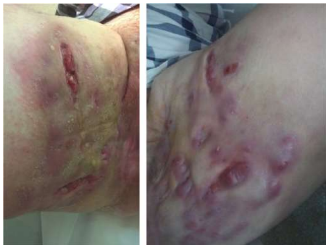
Figure 1. Both treated inguinal areas on the day of the hospital discharge.

by the patient whenever leakage necessary. We continued the NPWT for two weeks after the surgery, with the dressing change every two days in the beginning and every three days later (5 changes in total) and the concomitant intravenous antibiotic therapy. Perioperative antibiotic therapy corresponded to bacteriological tests, performed from lesional skin swabs, taking the potential risk for embryotoxicity in concern (erythromycin 600 mg i.v. three times a day and cefotaxime 2 g i.v. twice daily for ten days).