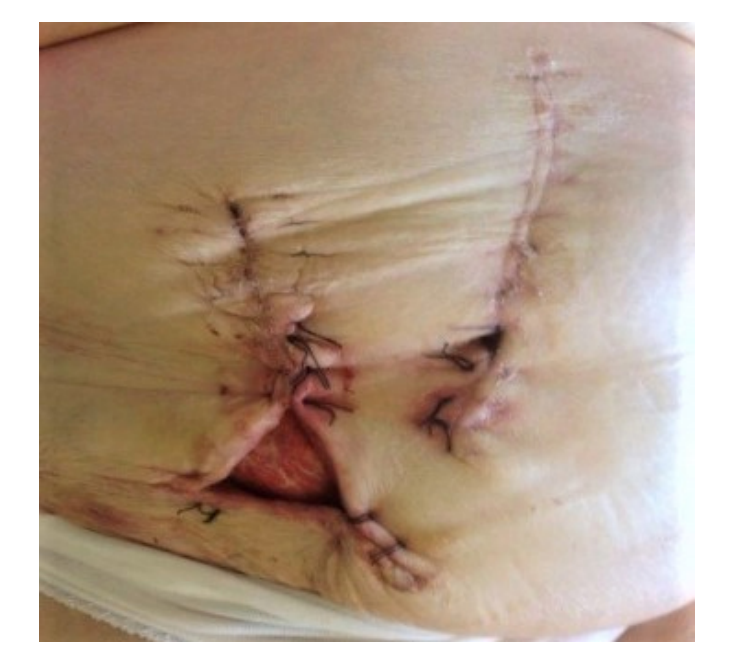
Figure 5. The wound in 33rd postoperative day.

right groin, and gluteal region.<sup>9</sup> In the beginning, the fistula formation process causes only the presence of a cutaneous tender inflammatory area or an abdominal wall abscess which later, spontaneously, flows out through the skin. Radiological findings (US and CT) are usually non-specific, ambiguous, and misleading at the initial presentation.<sup>9</sup> The management of this rare gallstone disease complication includes abscess drainage, sepsis control, through a broad-spectrum antibiotic therapy, cholecystectomy, and fistulous tract excision. The abscess drainage and the open or laparoscopic cholecystectomy with the fistulous tract excision can be performed as a single or two-stage procedure.<sup>9</sup>