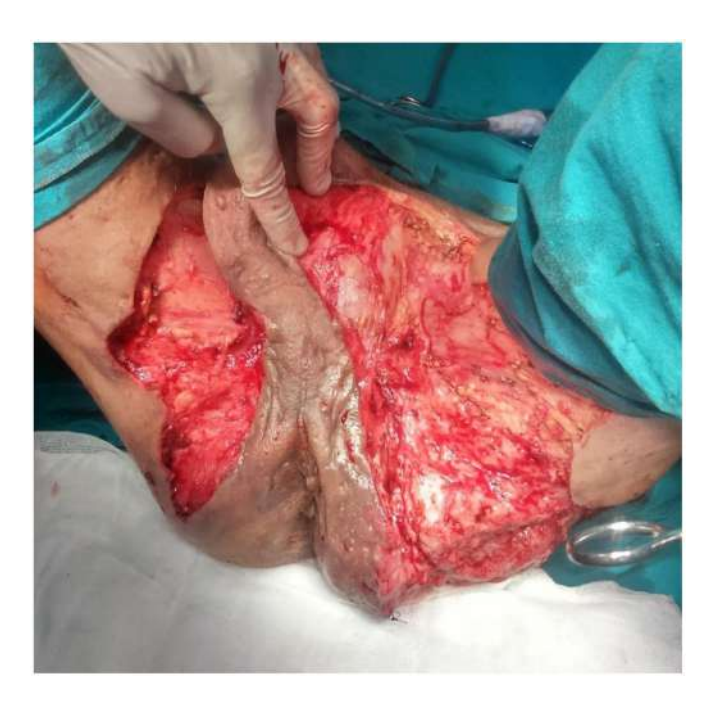
Figure 2. Subtotal excision of phlegmon tissues with margin. The perianal site was saved to keep tightness with NPWT dressing using adhesive gel patches. The anus was still excreting.