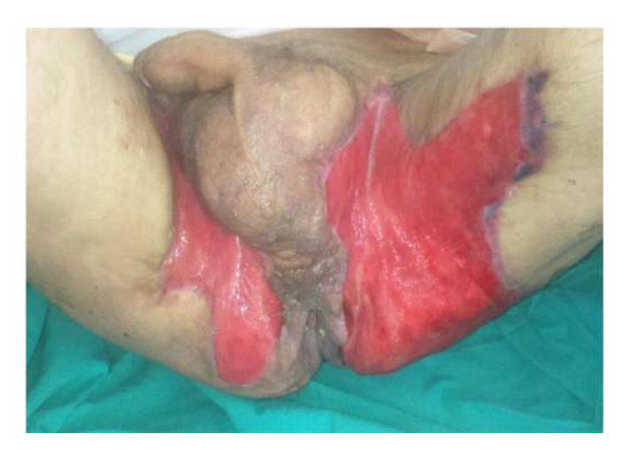
Figure 5. Satisfactory cleanliness before skin transplantation.

The preparation of the wound for skin transplantation was impeded by infection. Dressings with Bacitracin, Neomycin, Povidone-iodine (transient hypersensitivity to iodine) and liquid paraffin were changed every 2-3 days. Silver-containing dressings had a poor clinical effect: biofilm and infection returned. Finally, satisfactory wound cleanliness was achieved