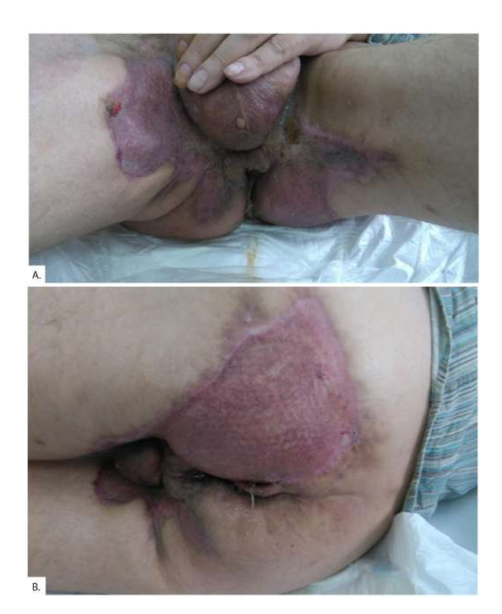
Figure 6. Discharge status. Medium-thickness skin transplant accepted in >90%, partly healed by granulation and epithelialization.

intravenously — assuming a mean of 7000 kcal per 1 kg of body weight. The patient avoided 20 kg weight loss. His body mass index on discharge was similar to that on admission, but with no edema and after large excision. The patient had gained over 30 kg body mass by the 5th-month follow-up.