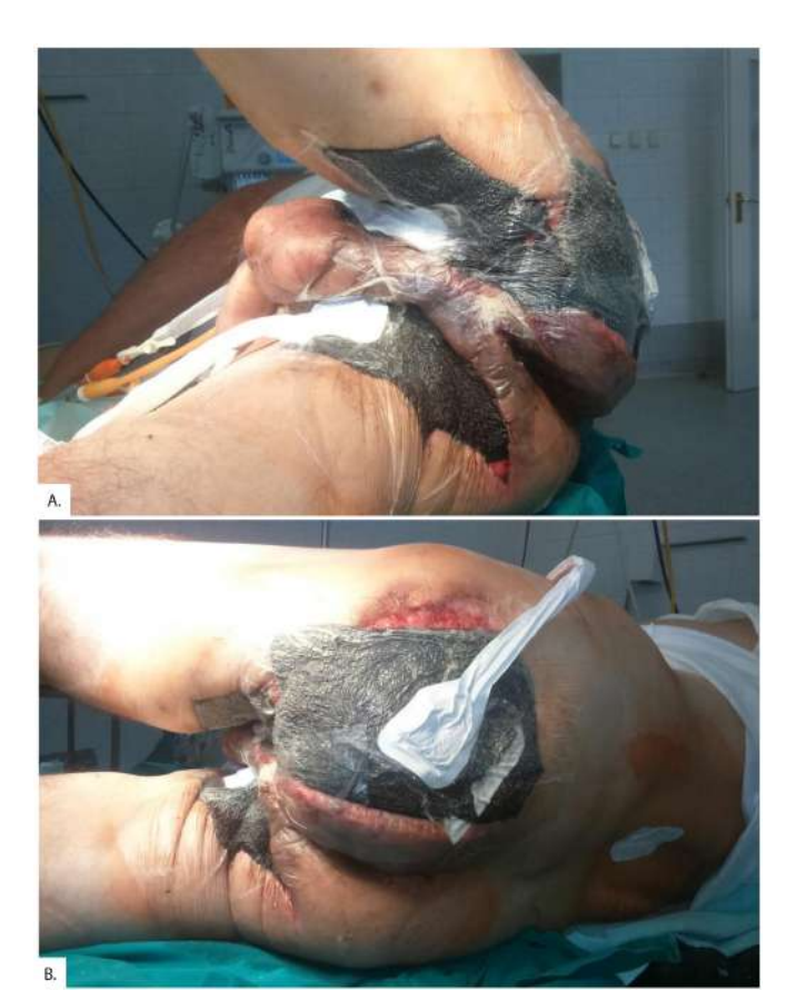
Figure 3. NPWT dressing. Two separated areas were connected with one processor by 3 soft ports. Adhesive gel patches applied perianally.

appeared 3 years previously as a small abscess on the scrotum base spreading superficially to both inguinal, anal and left gluteal sites. At this time, the patient had been treated in an out-patient clinic as well as hospitalized on infectious disease and dermatology wards; the patient did not deliver any past medical history reports. He had undergone multiple antimicrobial therapies combined with dressings and locally-acting antiseptic agents. There had been no satisfactory clinical improvement, and the disease progressed as his general status had gradually worsened. He presented with chronic fever, lost approximately 20 kg of body weight and had to cease his academic job due to the inability to sit and continued worsening of his general status.